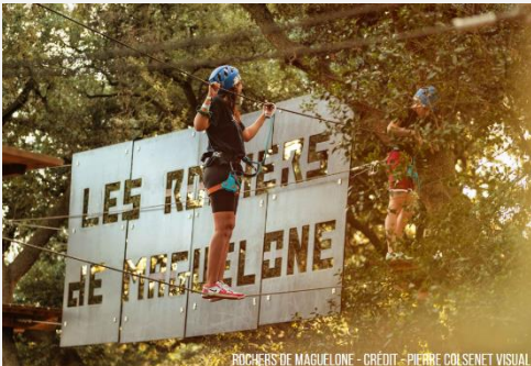
ROCHERS DE MAGUELONE