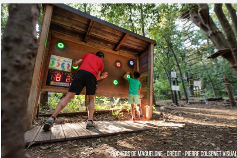
ROCHERS DE MAGUELONE - CRÉDIT : PIERRE COLSENET VISUAL