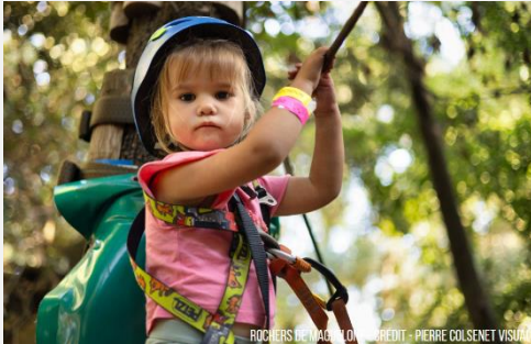
ROCHERS DE MAGUELONE