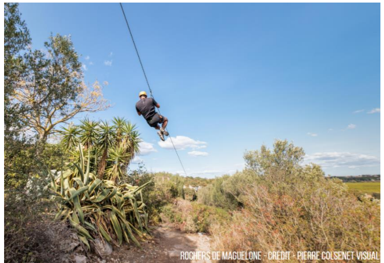
ROCHERS DE MAGUELONE

In Villeneuve-lès-Maguelone, only 20 minutes from our residence, come and discover the Rochers de Maguelone. This natural leisure park welcomes you in the heart of a forest of hundred-year-old oaks and invites you to share strong emotions with your family or friends through a multitude of outdoor activities!